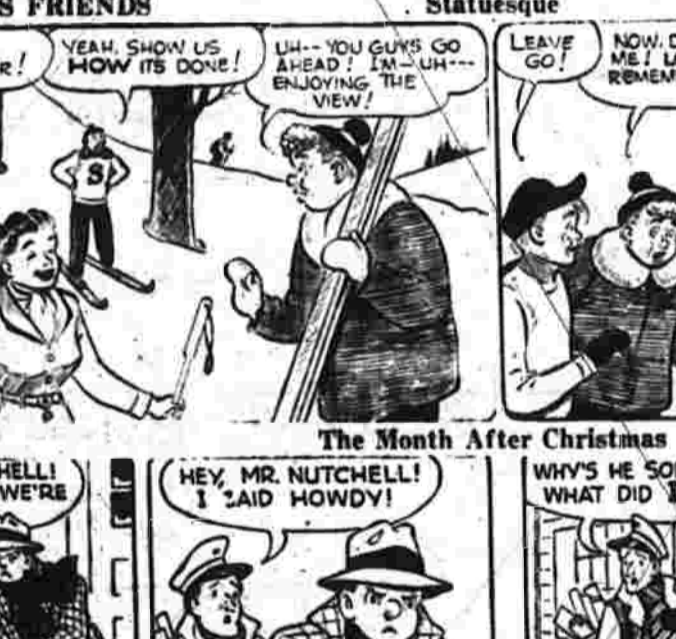
Right Behind You