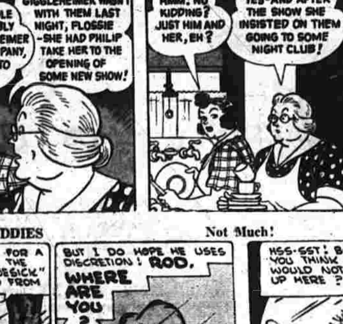
BY V. T. HAMLIN